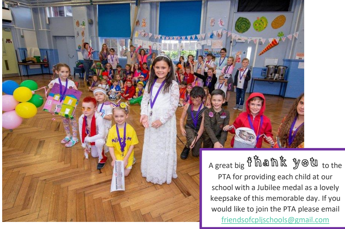
Thank you to all of you that took part. It really was a day to remember and a fantastic celebration!