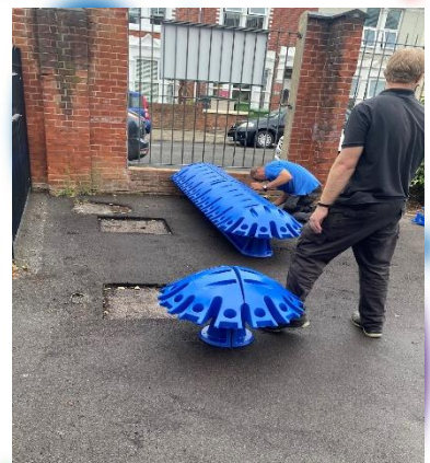
... and new bike and scooter storage!