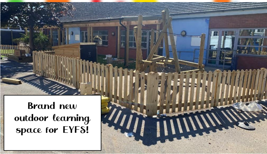
Brand new outdoor learning space for EYFS!