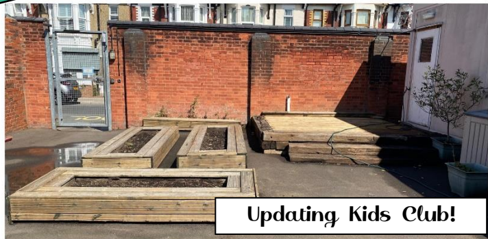
Updating Kids Club!