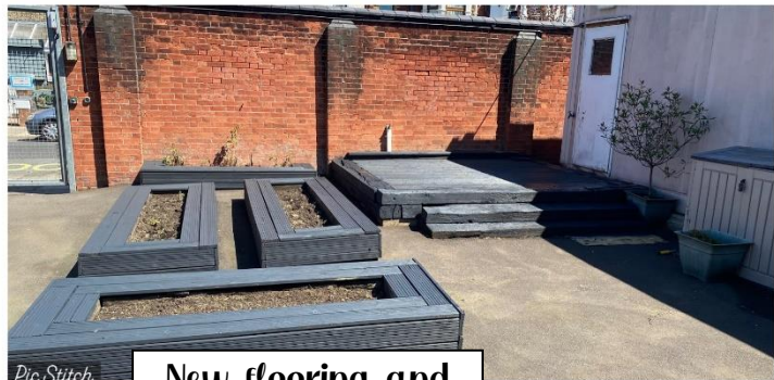
New flooring and decorating the corridors in the junior building...