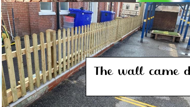
The wall came down!